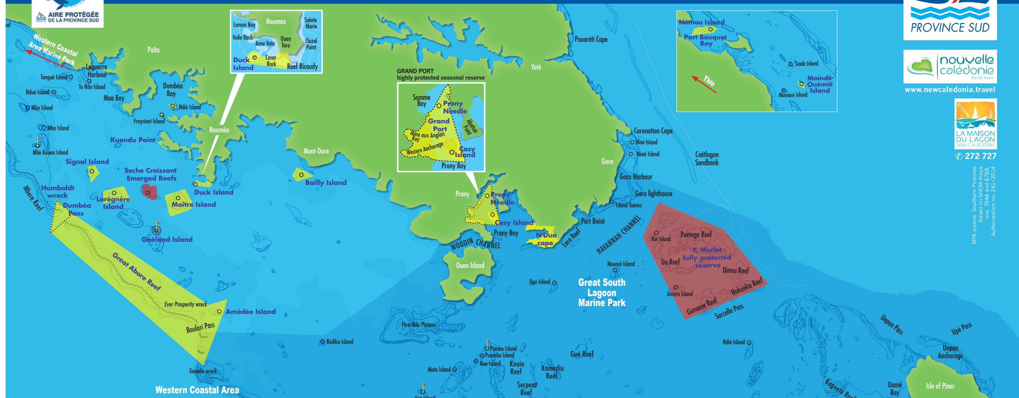
Western Coastal Area

MPA source: Southern Province Based on SHOM maps nos. 7644 and 6768. Authorisation no. 241/2014