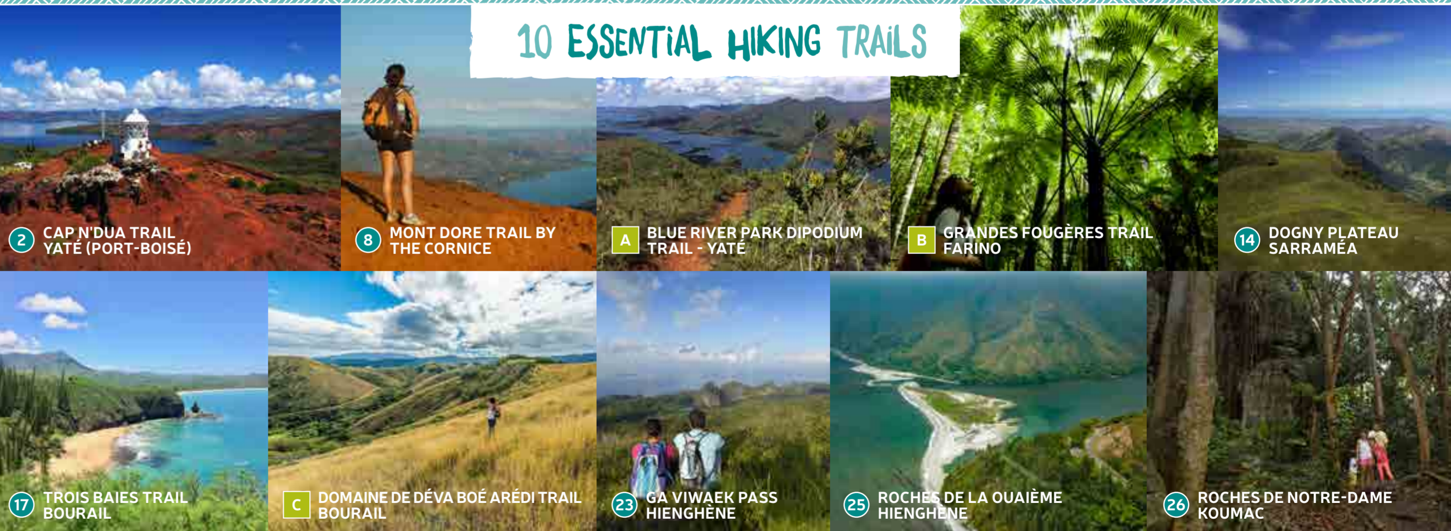
2 CAP N'DUA TRAIL YATÉ (PORT-BOISÉ)